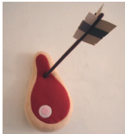
Steak Through the Heart, 2005 (fabric, neoprene and toy stuffing, 66 x 56 x 43 cm)