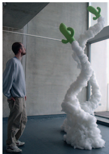
Heat-Seeking Cactiles, 2004 (fabric, plastizote foam, toy stuffing, steel bar and concrete, dimensions variable)