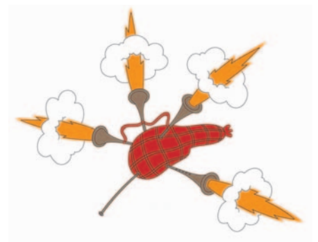
Battlepipes, 2007 (mixed media)