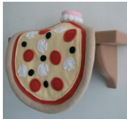
Shelf Life, 2007 (fabric and toy stuffing, 66 x 64 x 30 cm)