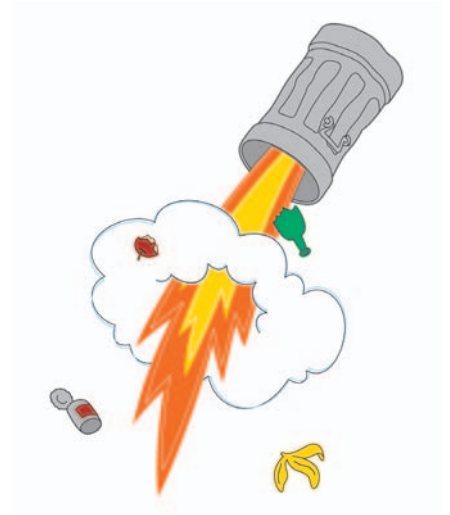
Jet Set Trash, 2007 (mixed media)

In this exhibition Vincent James will be showing Battlepipes a new large-scale sculpture in which a flying set of bagpipes spit out smoke and flames.