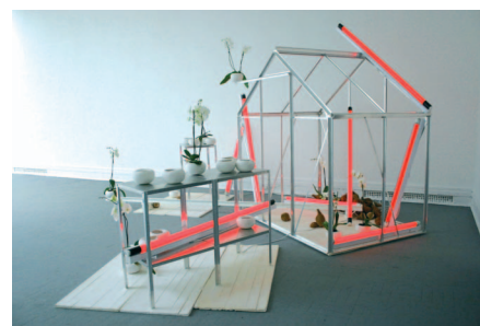
Nebular (Uma Thurman), 2007 Aethan Wills

I often use the particular potency of red and white as an on-going rhythm. These motifs have become increasingly established as signifiers of both the seductive and the repellent. The crimson denotes a wound delivered to flesh, while the white signifies its cauterization or purification; yet red also denotes the innocence of valentine love, jejune candy sticks rather than the barber's pole.