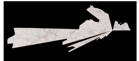
Outer Field View 2008